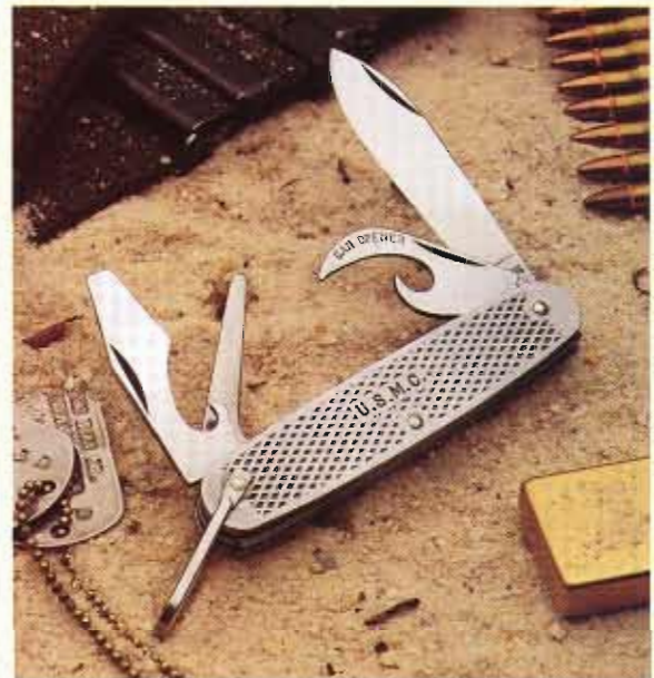
CAMILLUS® U.S.M.C. UTILITY KNIFE The knife used by Marines since World War II