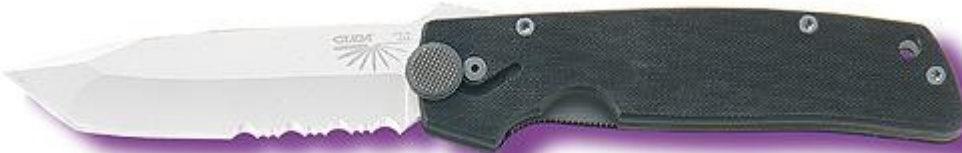
CUDA Quik-Action Tanto Blade (left-handed, serrated) CUD2SL